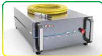
Fiber Laser Source