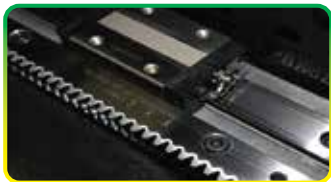
Double-Drive Precision Rack Drive