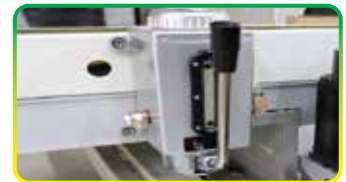
Lubricating Oiling Machine